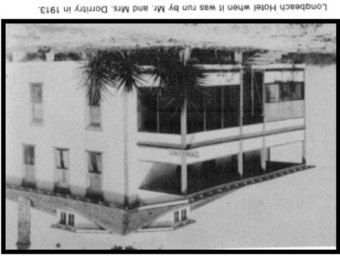
Jordan/Longbeach Hotel/ Inn